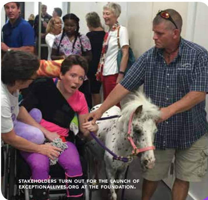
STAKEHOLDERS TURN OUT FOR THE LAUNCH OF EXCEPTIONALLIVES.ORG AT THE FOUNDATION.