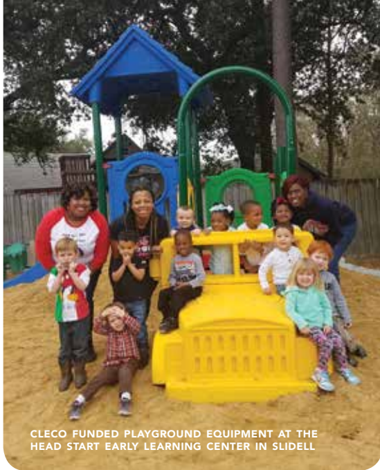
CLECO FUNDED PLAYGROUND EQUIPMENT AT THE HEAD START EARLY LEARNING CENTER IN SLIDELL